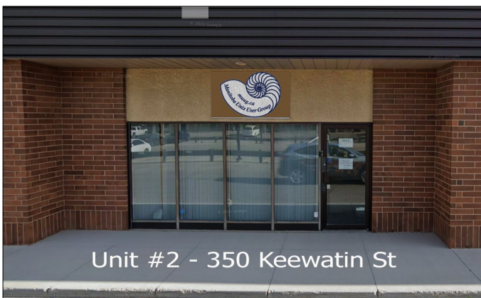
Unit #2 - 350 Keewatin St

If you show up in person you will be treated to more beverage choices than we've offered in over a decade: coffee, tea, and pop, as well as cookies. And parking is free, copious, safe, and just a handful of feet from the door.